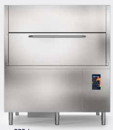
▶ PPE-L Personal Protective Equipment washer - large

This special solution washes personal protective equipments in steel, composite, rubber, fabric, plastic etc. from oily substances, residue of combustion gases, toxins and other highly hazardous substances