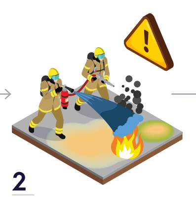
On site - Dangerous particle contamination